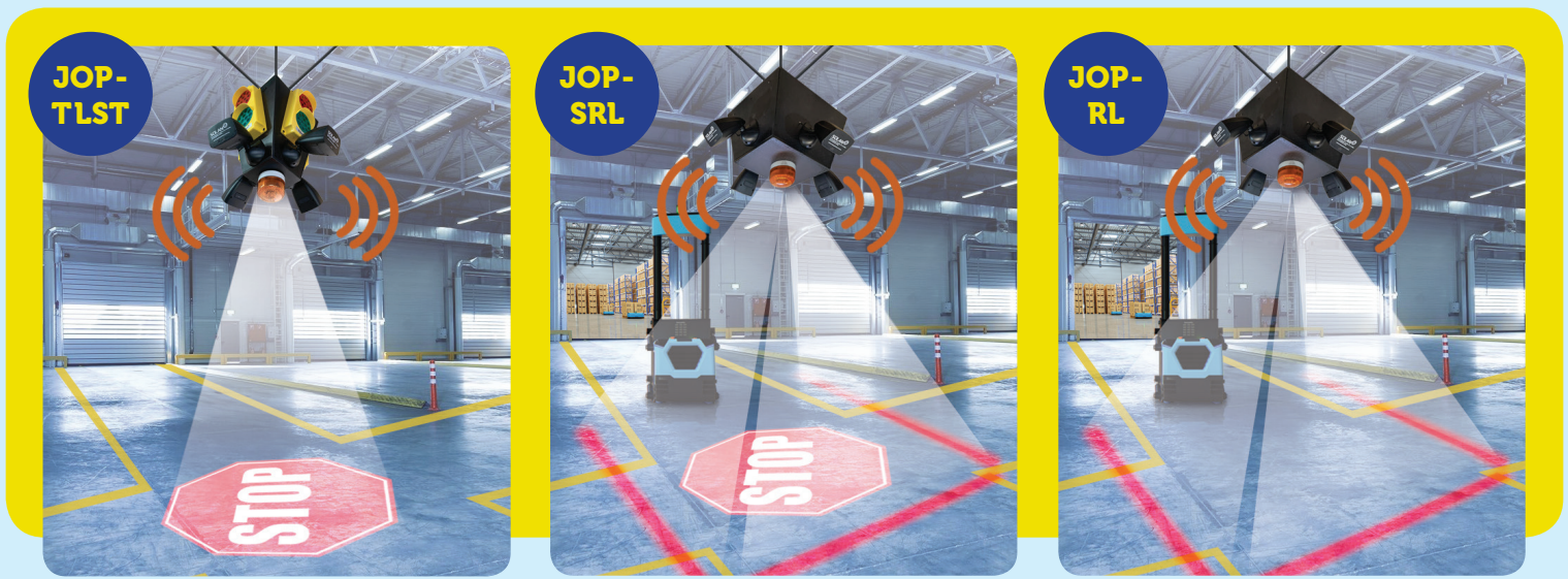
JOP System with 4-way forklift identification, 4 traffic lights + 4 detectors + stop sign