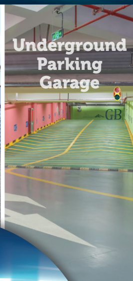
Underground Parking Garage