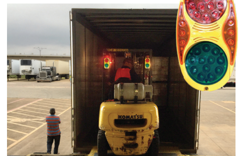
i-stop is needed to present accident like this one