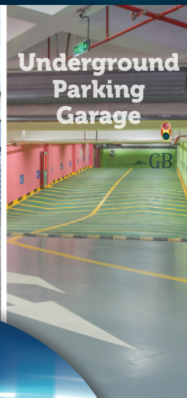
Underground Parking Garage